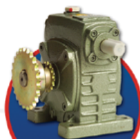
Heavy Duty Gearbox Efficient & Quiet