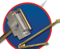
Quick-Release Swing Arm Simple & Secure No-Pinch Design for Added Safety No Welding Needed