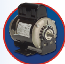
Motor Heavy Duty Instant Reversing Continuous Duty