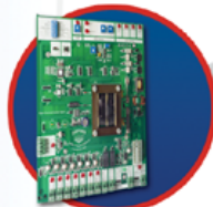
Control Board Easy to Use & State-of-the-art Advanced Features Come Standard Built-in Lightning & Surge Protection